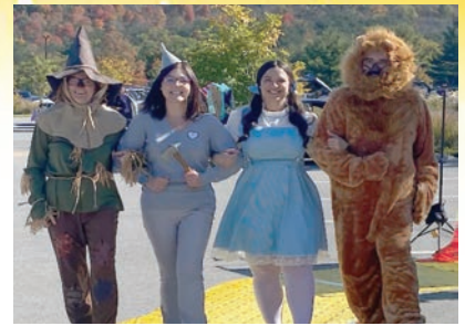
Rocky Gap Trunk or Treat