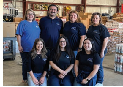
Thanksgiving Food Drive