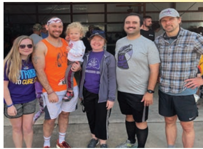
CF Warrior Run